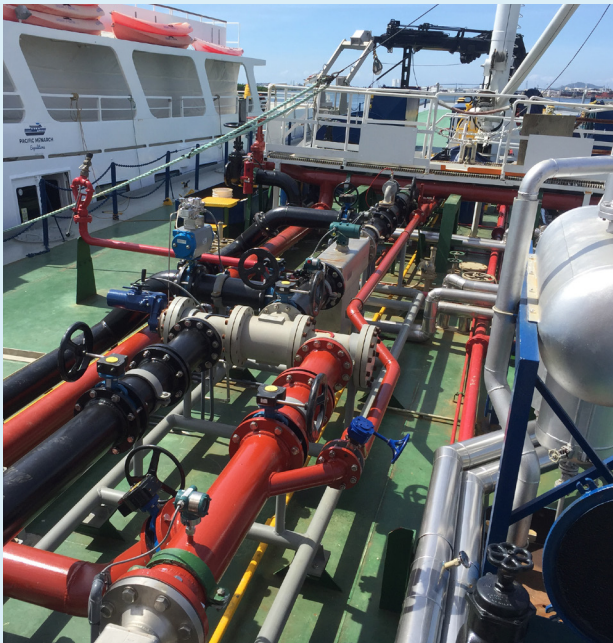
On a Ship Built for performance in demanding conditions