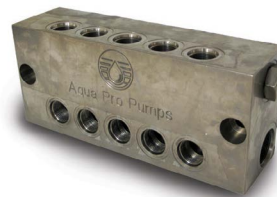
AquaPro® 5P50 Manifold Block