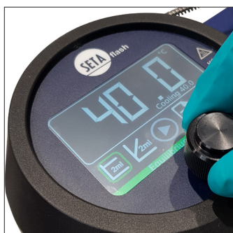
Select test temperature