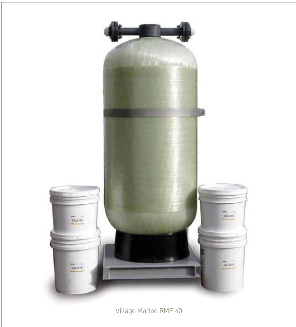
Village Marine RMF-40