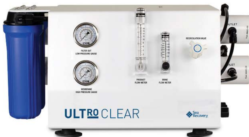
Ultra CLEAR DFII - compact